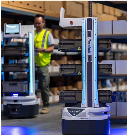
Directed Each and Batch Picking

Fetch AMRs augment the existing workforce by automating repetitive tasks and minimizing unproductive travel and dwell times, enabling experienced personnel to remain on task and productive in their respective zones.