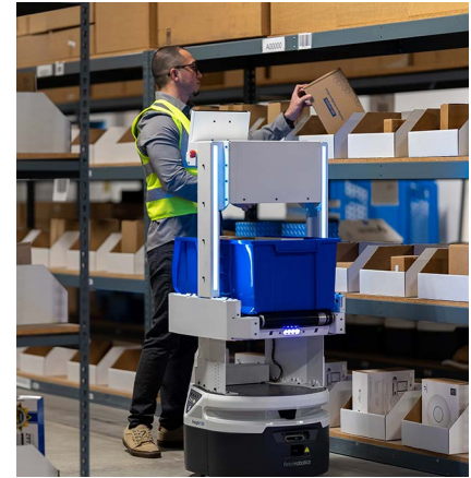
Interleave Pick and Replenishment

Introducing automation into fulfillment operations improves coordination between picking and replenishment activities, maintaining inventory levels for optimum productivity.