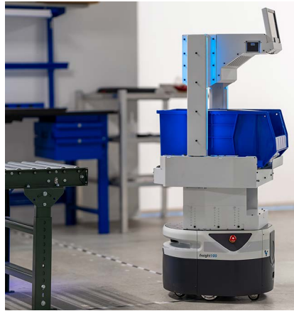
Pick to Tote with Automatic Conveyor Transfer

Automation reduces congestion in storage aisles, which helps limit interactions between workers and potentially hazardous heavy loads and equipment, enhancing safety as well as performance and productivity.